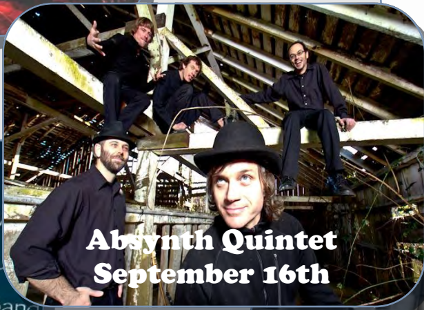
Absynth Quintet September 16th