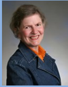
Mayor Crystal Shoji