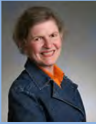
Mayor Crystal Shoji