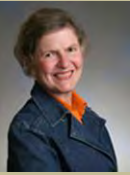
Mayor Crystal Shoji