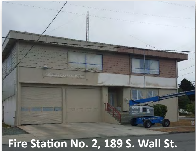
Fire Station No. 2, 189 S. Wall St.

We are hopeful that the caulking will keep moisture out and the paint will improve the aesthetics of the building for the neighborhood.