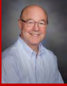
Mayor Joe Benetti