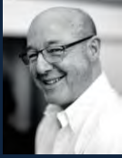
Mayor-Elect Joe Benetti