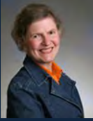
Mayor Crystal Shoji