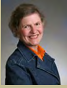
Mayor Crystal Shoji