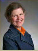
Mayor Crystal Shoji