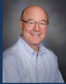
Mayor Joe Benetti