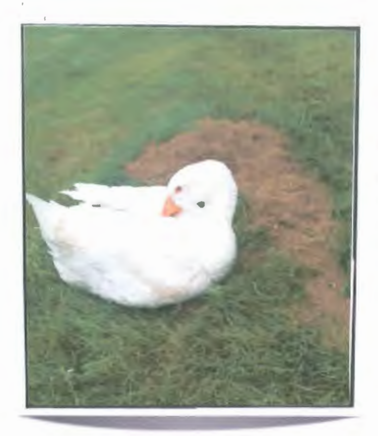
Joey the Goose was rescued in 2013 after being abused by kids at Mingus Park because she was lame. She was rehabbed and adopted and now is doing well. Friends of Mingus Park considers Joey a symbol of triumph over abuse.....